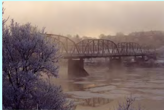
Alberta - Saskatchewan - Manitoba - Canada